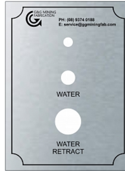
Marine grade stainless steel, with cutouts, laser etched