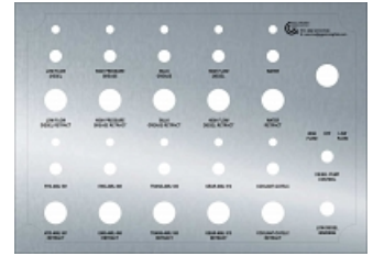
Marine grade stainless steel, with cutouts, laser etched