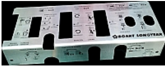
Marine grade stainless steel, with cutouts and laser etching